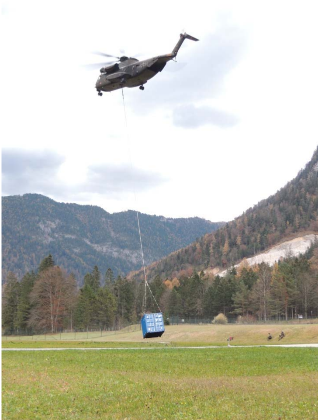
Fig. 1: CH-53 of the Army Aviation with TLM_90_30 rope (WLL 90 kN).