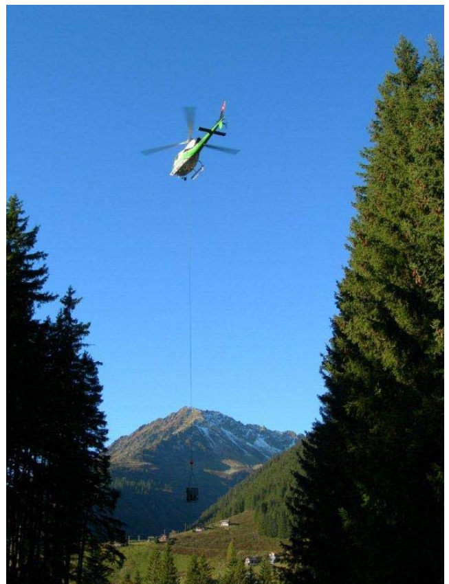
Fig. 2: AS350B3 of Swiss Helicopter AG (Heli Gotthard) with TLDS_14 rope (WLL 14 kN)