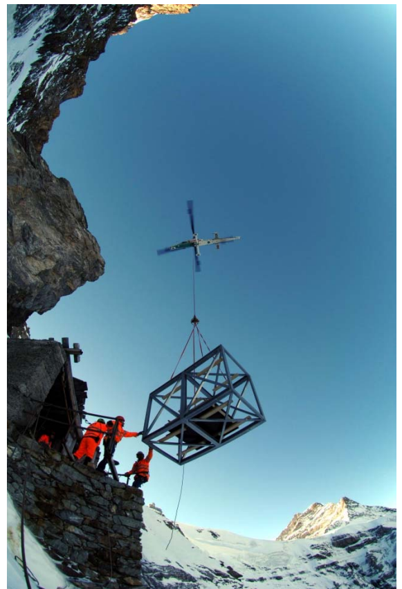
Fig. 4: KAMAN K-1200 "K-MAX" with TLP_55_30 rope (WLL 30 kN).