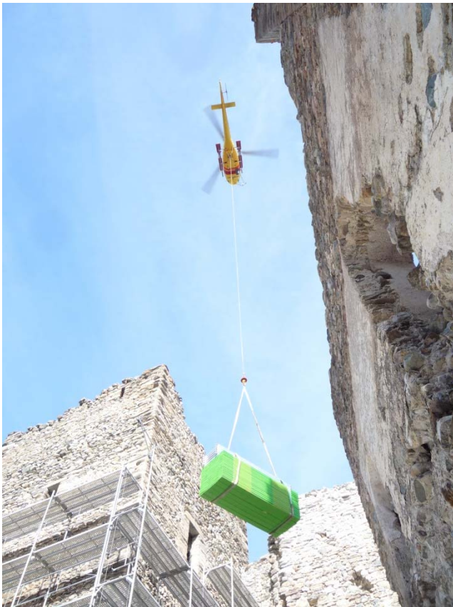
Fig. 3: AS 350B3e of Heli Bernina AG with TLDS+_14_30 rope (WLL 14 kN).